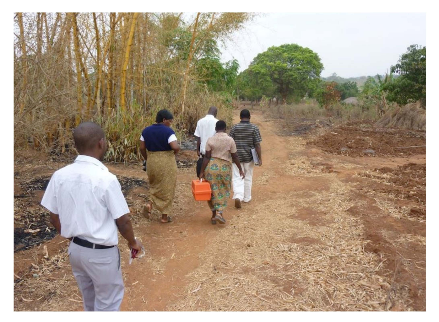
Figure 3. Neno Palliative Care Program team members conduct a home visit in a rural village. Five members of the Neno Palliative Care Program (NPCP) team travel by foot to reach the home of a palliative care patient living in rural Neno district, Malawi. An Abwenzi Pa Za Umoyo/ Partners In Health Medical Officer with specialized training in palliative care (foreground) leads the home visit. He is accompanied by (from left to right) a palliative care nurse, a Program on Social and Economic Rights social worker, a Village Health Worker and a NPCP clerk. NPCP team members work together to assess and treat patient pain and other physical symptoms, provide disease-specific care for serious chronic illnesses, and offer psychosocial support to patients and their families. doi:10.1371/journal.pone.0110457.g003

over the follow-up interval. We recorded 4 deaths (6%) that occurred before the patient's first scheduled follow-up encounter, each transpiring within 1 month of program enrollment (Table 4).